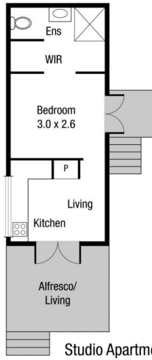
Studio Apartment (Not In Position)